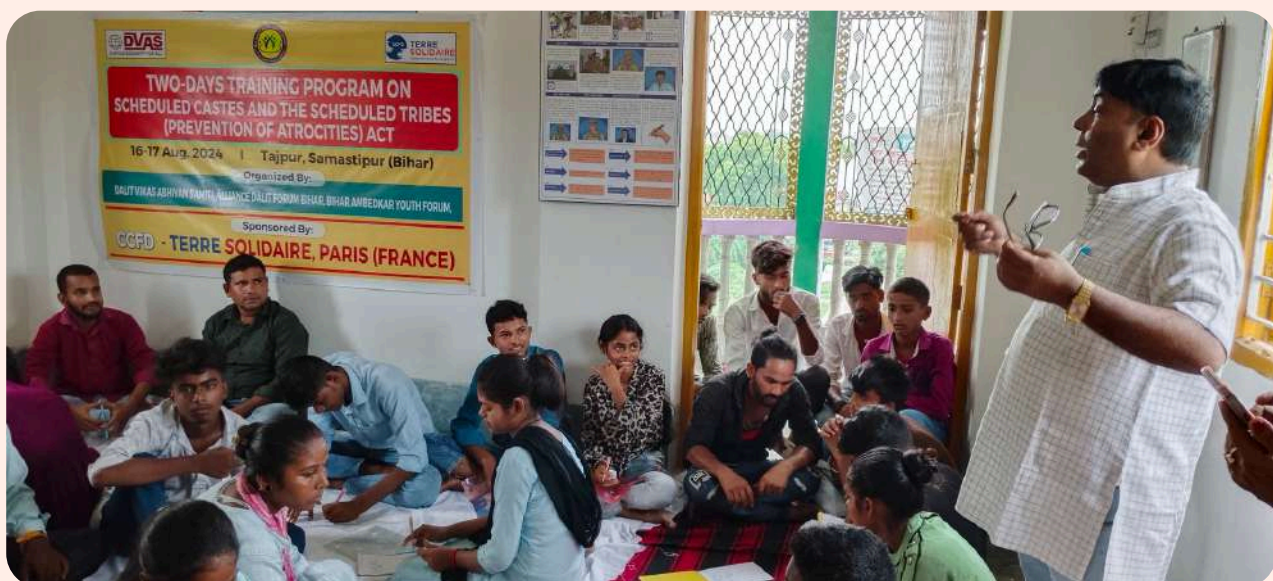
Scheduled Castes (Prevention of Atrocities) Act training