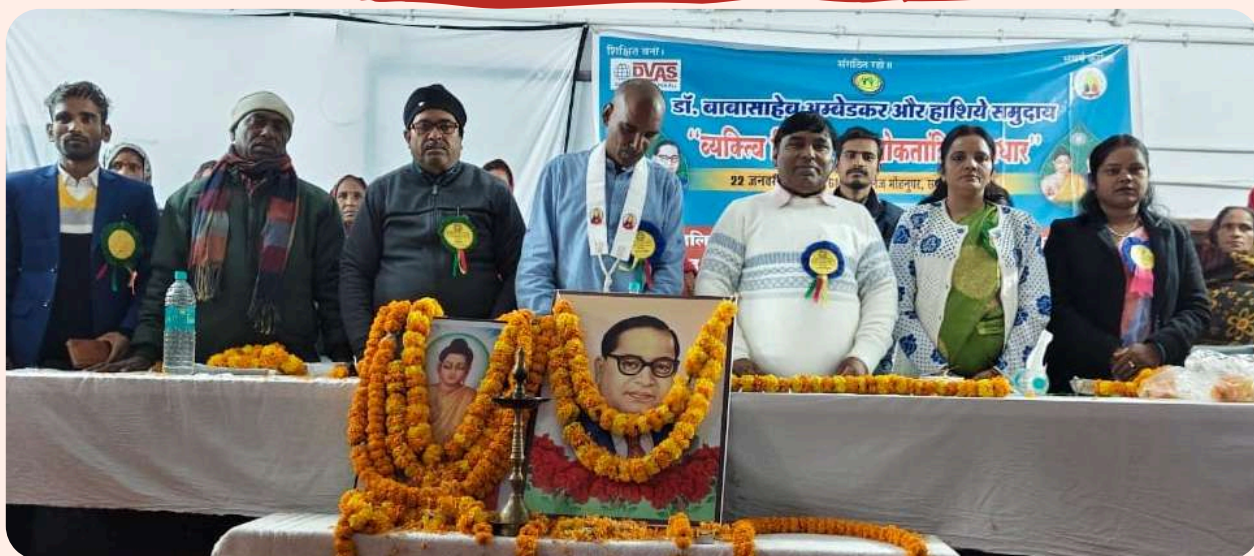
A high-level symposium was organized on “The Democratic Foundation of Personality Development: Dr. Babasaheb Ambedkar and Marginalized Communities.”