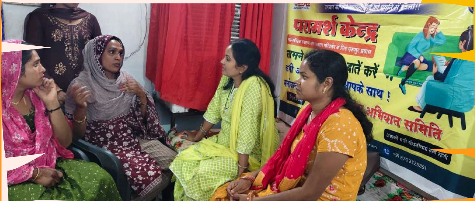
A psychologist providing mental health counselling to the LGBTQ+ community.

This initiative not only reduced the stigma around depression but also encouraged active participation in daily life. Youth reconnected with educational activities, and many overcame suicidal tendencies, substance addiction, and climate-induced mental distress. The campaign fostered sensitivity towards mental health and inspired individuals to pursue joyful, dignified lives. It affirmed that mental health is a right—one rooted in the Universal Declaration of Human Rights and the preamble of the Constitution of India.