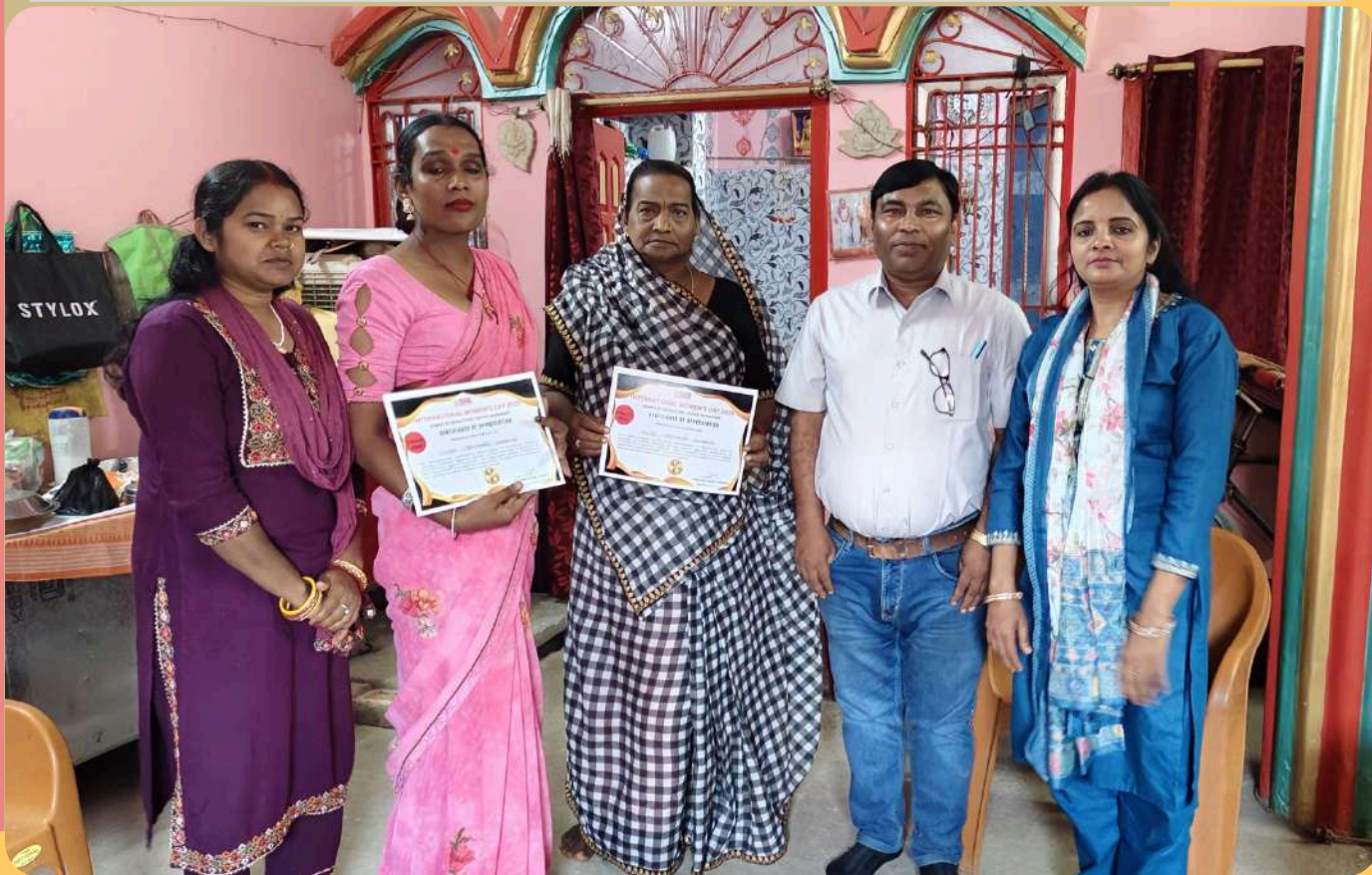
"Celebrating and honoring LGBTQ+ community members with the DVAS team"